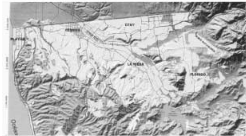
Figure 2: Tijuana's Physical Setting