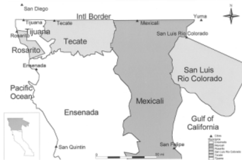
Figure 1: Cities and Municipios at the Head of the Baja California Peninsula

ing exclusively for export in 1965, being allowed to import their supplies and equipment into Mexico duty free, process the materials there, and export the products with taxes paid only on the value added (Kopinak, 1996, pp. 7-18). The fact that more hazardous waste has been generated in Tijuana maquiladoras than in any other border city is consistent with the fact that in 1998, Tijuana was home to two thirds or more of the plants, employees, and value added produced by maquiladoras in the state of Baja California. In 2000, Tijuana was home to approximately 22% of the country's maquiladoras. 1